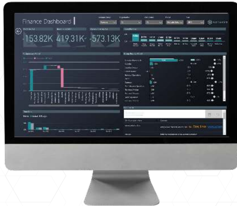
Fig. Finance dashboard for demand planning in Acterys

Workflows allow you to build an automated, repeatable process for data consolidation and schedule forecast approvals, report distribution, and other routine tasks. This saves a lot of time spent in manual data collection and ensures you are working with fresh data every time and plan for demand in real time.